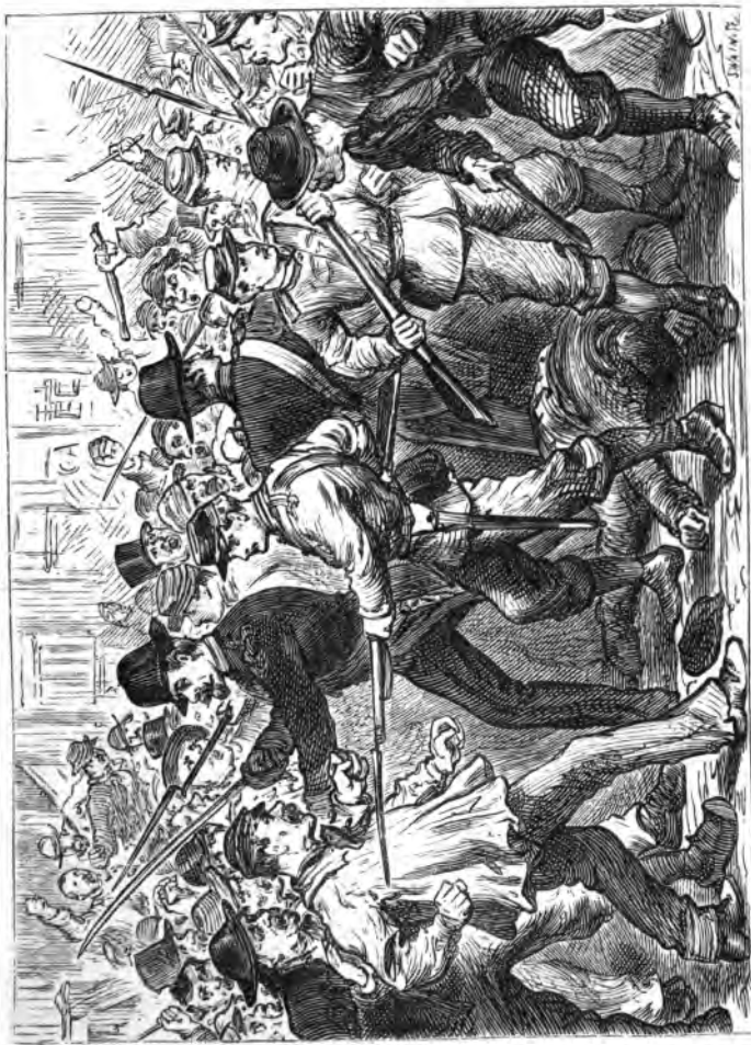
Rescue of a supposed Spy.—Page 48.